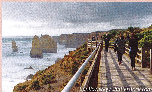
Tourists visit the world-famous Twelve Apostles rock formations in Victoria.