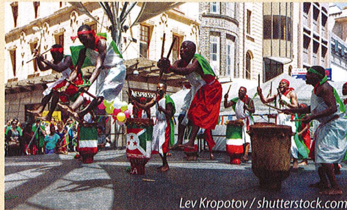
These dancers and drummers, originally from Burundi in Africa, are performing at an Australia Day parade in Adelaide.

Richer nations usually help those that are less well-off by giving international aid. This can be grants of money or help with large projects such as building bridges or hospitals. Mỹ Thuận Bridge (right) is a 1.5 kilometre bridge over a branch of the Mekong River in Vietnam. It was built in 2000 with the assistance of funds from Australia.